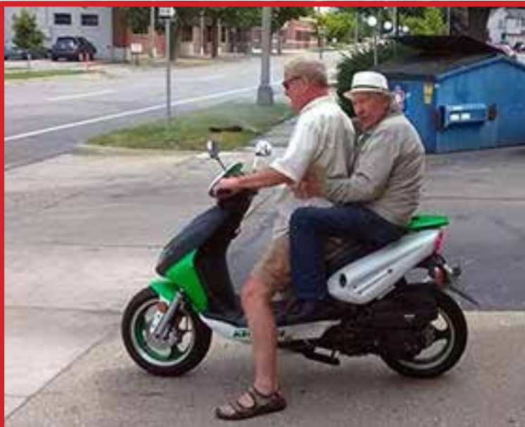
"People Helping People" Get to the polls and VOTE!